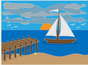
Please join us for the Cruise to Goose Pond.