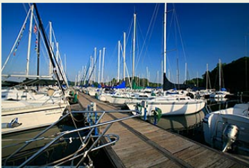
Where it's always a beautiful day to go sailing!!

Dock Master Quill Briggs 256-652-0916 Call Quill with Billing Issues and any Facilities Issues.