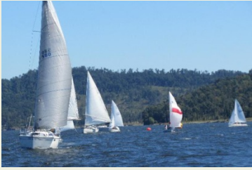
TVCC - Getting ready to race!