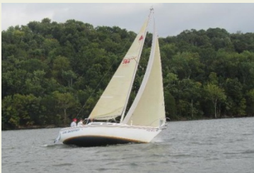
TVCC - Perfect racing conditions.

All schedules and copies of the Binnacle can still be viewed on the LGSC website.